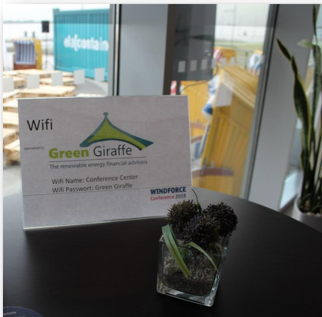
Caption: WiFi Code Green Giraffe